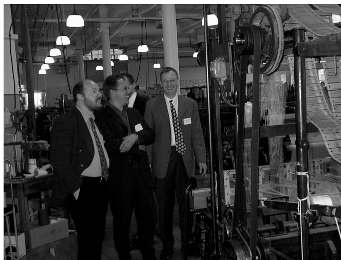
The City of Borås' reception was held at the Swedish Museum of Textile History where participants were informed about the local university college's textile research. Various production steps were demonstrated using machines from the XIX and XX century.

participants with a different expertise. This was done to promote cross-fertilisation of ideas between different subjects, a key objective of the workshop, and the participants appreciated the exchange. Each WG had a number of subjects to discuss, which, to some extent, reflected the content of the eight keynote lectures. Some of the subjects were covered by more than one WG, from different perspectives. Among the items discussed and summarised by the WGs were: the most important developments in the different fields the last five years, the impact of accreditation of PT providers on laboratories, what approaches to using uncertainty should be used in PT, and how PT fits in the overall structure of metrology in chemistry.