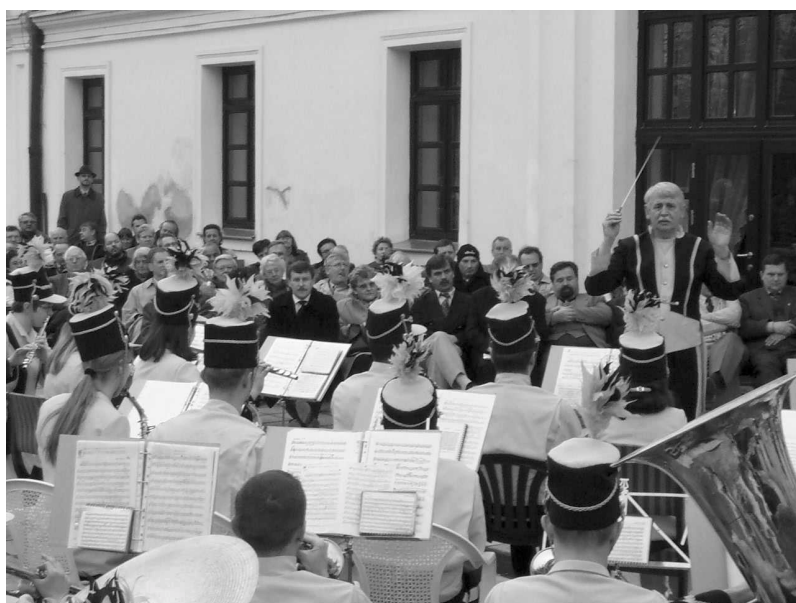
A serenade to EURACHEM: The Firemen's Orchestra from Wyszkow (a neighbouring locality of Popowo) performed popular tunes.

EURACHEM's 2001 General Assembly was held in Popowo (Poland) from 19-20 April 2001, in conjunction with meetings of the Executive Committee, the Education and Training working group, and the Measurement Uncertainty and Traceability working group. The meeting was attended by some 40 representatives from member countries and liaised organisations, and chaired by E. de Leer. A special welcome was extended to the representatives from the new member countries.