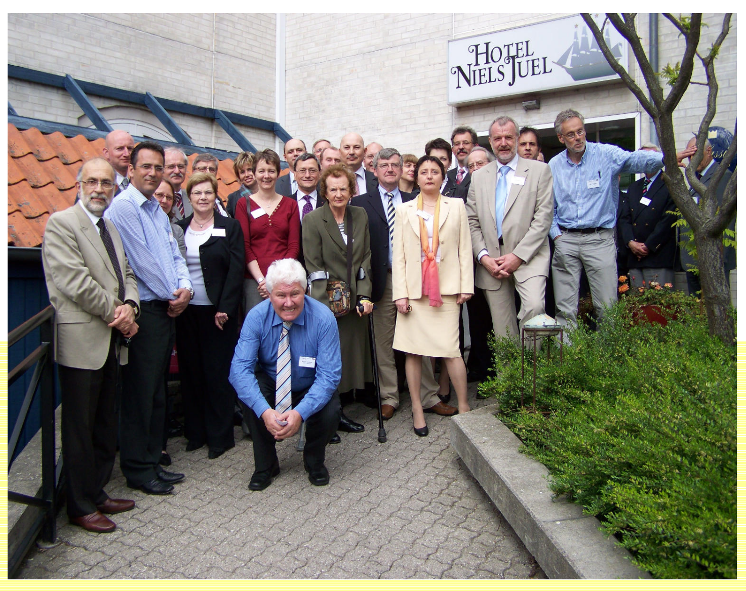
Delegates at the 26th Eurachem General Assembly, Copenhagen, May 2010