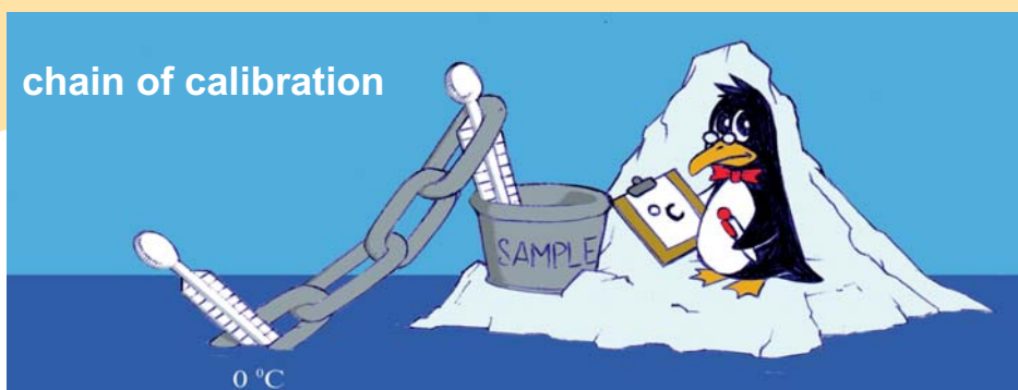
Illustration by Douglas Hasbun, taken from the Traceability Leaflet, (for more information on Eurachem leaflets see page 4)