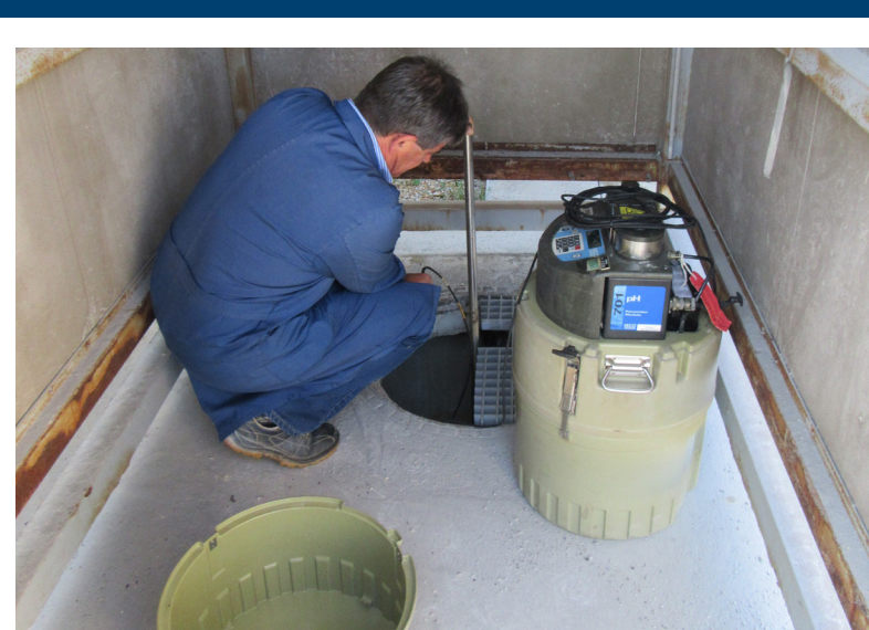
Figure 1: Sampling location and procedure [3, 4] Preparation of unfiltered sample: Conservation of sample: addition of nitric(VI) acid to pH < 2.

Preparation of filtered sample: Filtration through 0,45 \mu m filter. Conservation of sample: addition of nitric(VI) acid to pH < 2.