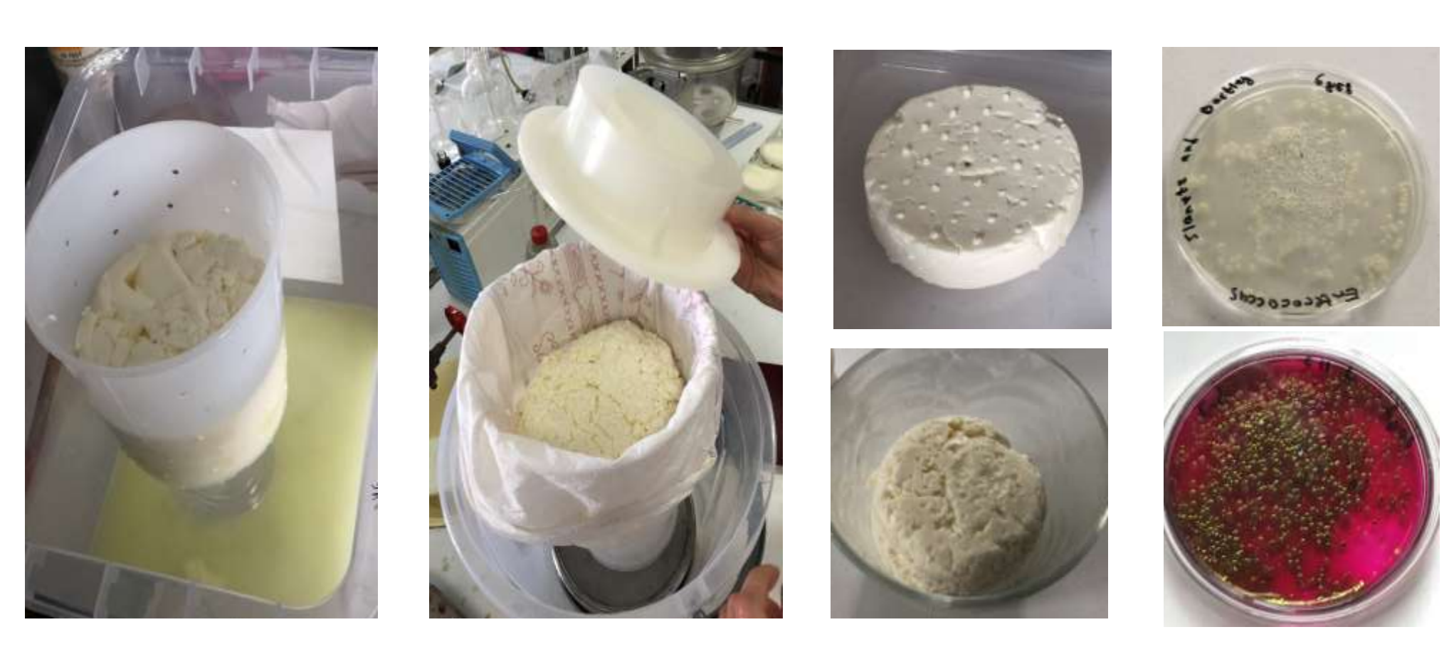
Figure 1. Production steps of cheese Imeruli Kveli

Six cheese samples were prepared under laboratory conditions following the production steps described in the PGI document [1]. The samples were stored in different conditions: in the refrigerator, at room temperature, and in brine. The microbiological indicators of each sample were monitored at each relevant manufacturing step: in raw milk, fresh cheese, and fermented cheese. Detection and enumeration of targeted microorganisms in the samples Total Viable Counts, Enterobacteriaceae, and Escherichia coli were monitored by standard culture method. Thus, one ml from dilution was inoculated on commercially available selective and differential growth media [4,5,6].